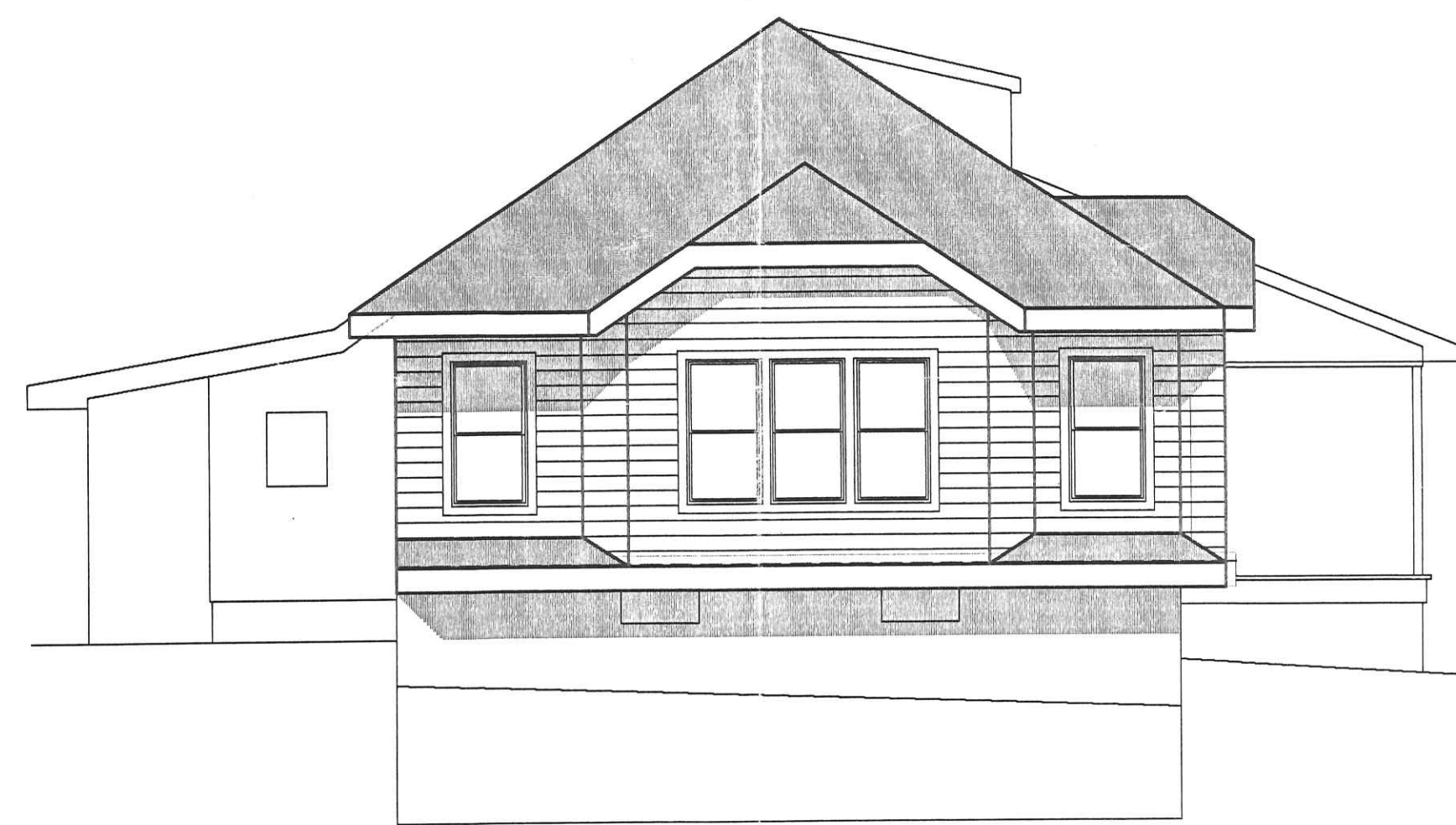
SIDE ELEVATION SCALE: 3/16"=1'-0"